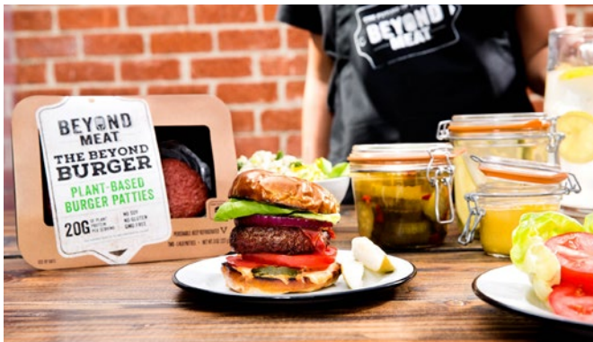
Plant-based proteins have been identified as one of the top trends for 2016.