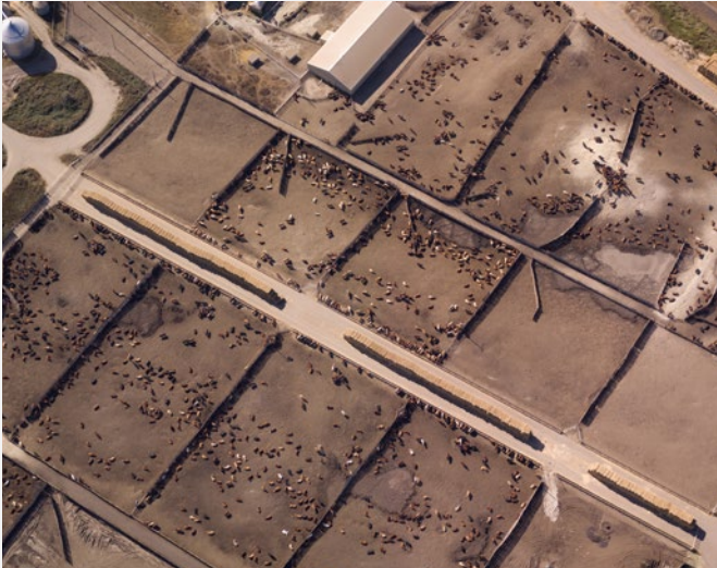
Cattle feedlots contribute to environmental damage.

“A recent University of Oxford study suggests that if unaddressed, the public health and environmental expenses associated with the increased demand for animal products could be up to $1.6 trillion globally by 2050.”