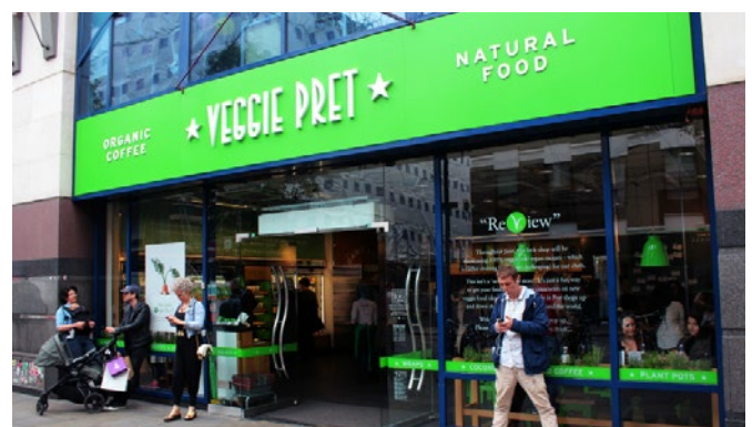
Sales at a London Pret A Manger rose up to 70% when a meat-free menu was trialed.

already paying attention to this trend and responding. For example, in summer 2016 Pret A Manger actively promoted a flagship store in the UK focused solely on meat-free and plant-based lunch options but branded ‘not just for veggies’ – the innovation paid off, with comparative sales at the branch reportedly up 70%. 49