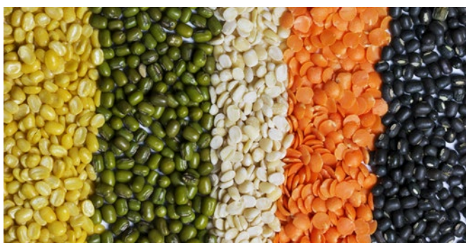
Grains, legumes, nuts, pulses and seeds can play a major role as an alternative source of protein.

“People don’t want to rely on animal derived materials and there is a lot of pressure on companies to switch to plant-based alternatives. It’s not just a handful of vegans asking for this.” 30